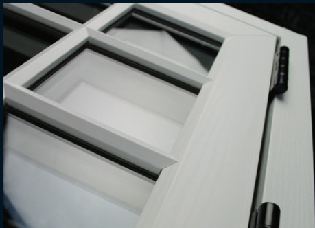
Dummy or functional butt hinges upgrade