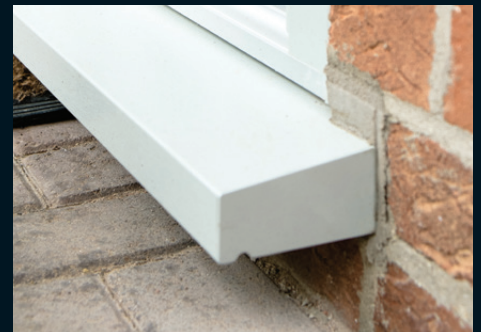
55mm Radlington cill option

Windows supplied loose glazed, unless sash is greater than 1350mm high then factory glazed and bonded.