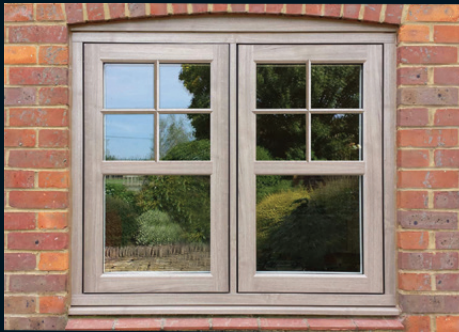
20mm Astragal and 60mm Transom bar upgrade