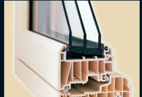
100mm outer frame for 28mm double glazing or 44mm triple glazing