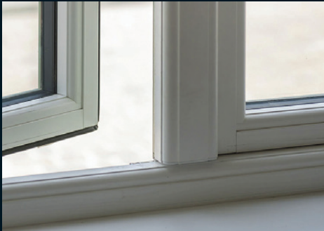
Residence9 has a traditional, decorative, internal finish