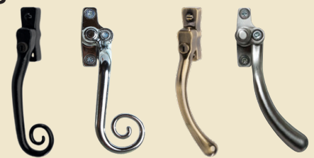
Monkey Tail, Tear or Pear Drop

Why not consider the other collections available from The Choices brand