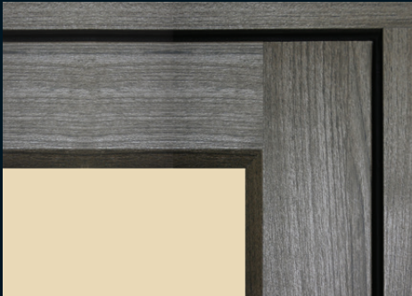
Standard - Fully mechanically jointed Option - Welded sash (Mech outer frame)

Flush 100 'Alternative to Timber' range is specifically designed to replicate 19th century timber windows and doors. With a flush external casement design and a decorative internal finish they are ideal when replacing 100mm traditional timber windows. A choice of styling options make them suitable for period and modern properties.