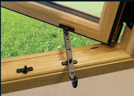
Dummy or functional stays upgrade