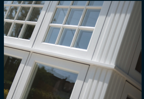
Flush external finishes with equal sightline and external transom bar upgrade