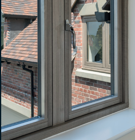
Straight lined innovation, bold looks create a bright living environment