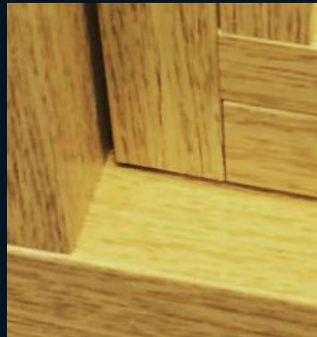
Feels elegant and timeless for those wanting a contemporary look in a traditional building