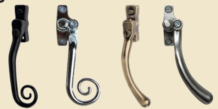
Monkey Tail, Tear or Pear Drop

Why not consider the other collections available from The Choices brand Windows, Doors, Conservatories & Orangeries manufactured from state of the art PVCU and Aluminium for Domestic and Commercial properties.