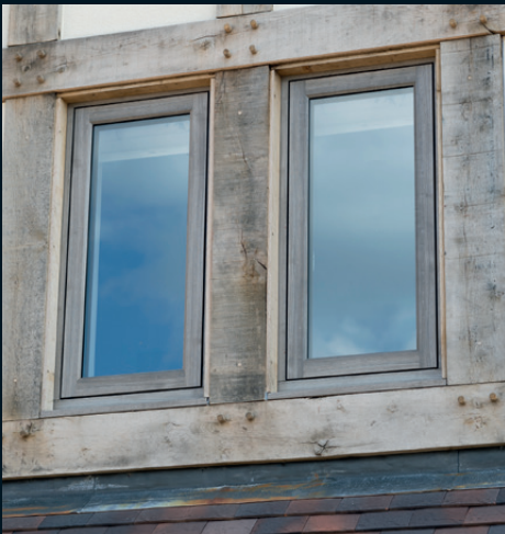
New complementing the old