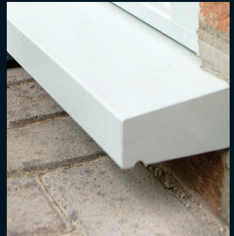
55mm Radlington cill option

Windows supplied loose glazed, unless sash is greater than 1350mm high then factory glazed and bonded.