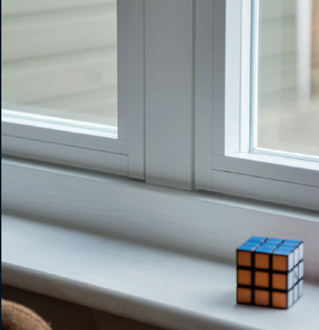
Very clear design with a cutting edge internal shape it is unconventional and unique

Flush2 is the architectural highlight of the Residence Collection, with clean lines and superb performance. With a flush external casement design and a square edge internal finish they are ideal when replacing 100mm traditional timber windows. A choice of styling options make them suitable for period and modern properties.