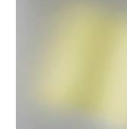
7mm Pyrodur with 6.8mm Satin